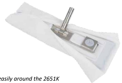
Dry and presat wipes fit easily around the 2651K VertiKlean MAX Wipe frame.